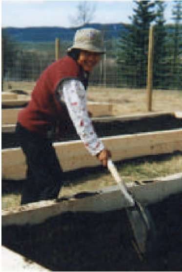
Last year's dream now in its second season

The garden is looking wonderful, lots of green, and slowly awareness and community involvement are increasing.